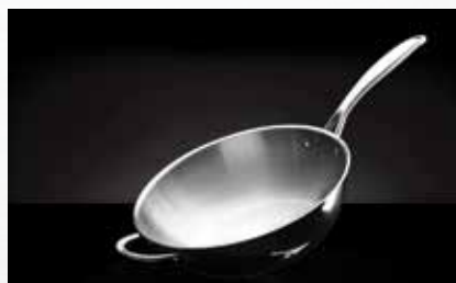
STAINLESS STEEL WOK