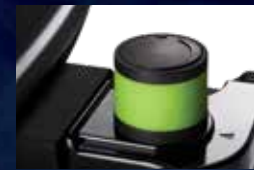
Adjustable Easy to Set Heat Control