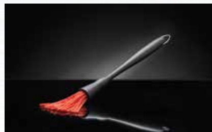
PRO SILICONE BASTING MOP