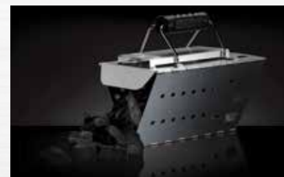
JETFIRE™ CHIMNEY STARTER