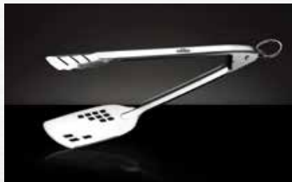
STAINLESS STEEL SPATUTONG