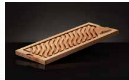
CEDAR INFUSION PLANK