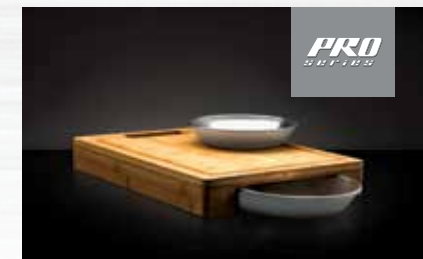
PRO CUTTING BOARD AND BOWL SET