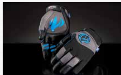
MULTI-USE TOUCHSCREEN GLOVES