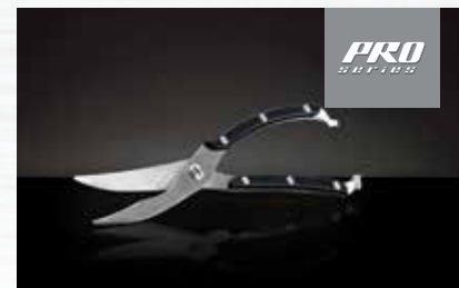
PRO POULTRY SHEARS