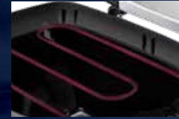
1500 watt Element