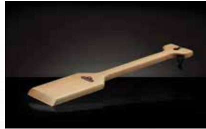
CEDAR GRILL SCRAPER