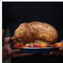
High-Top Lid for Larger Cuts of Meat