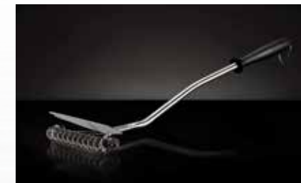
BRISTLE-FREE WIDE GRILL BRUSH