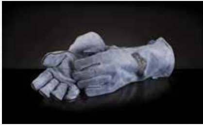
GENUINE LEATHER BBQ GLOVES