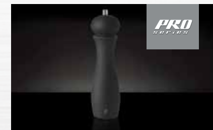
SALT AND PEPPER GRINDERS