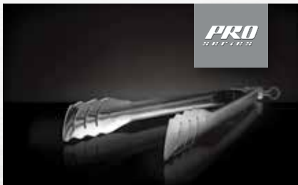
STAINLESS STEEL EASY LOCKING TONGS