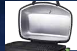
High-Top Cast Aluminum Lid