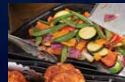
Optional Porcelain-enameled Cast Iron Reversible Griddle