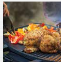
Large Grilling Area