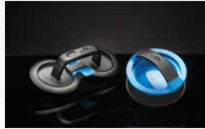
GOURMET BURGER PRESS KIT