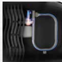
Advanced Cooking System