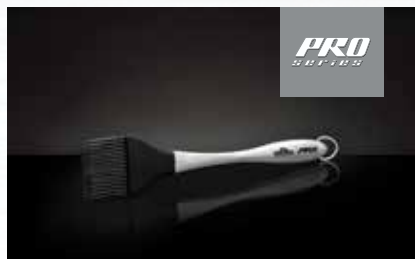
PRO SILICONE BASTING BRUSH