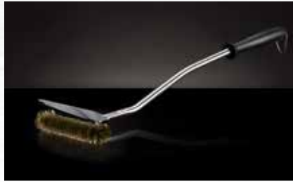
BRASS BRISTLE WIDE GRILL BRUSH