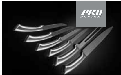
PROFESSIONAL KNIFE / CARVING SET