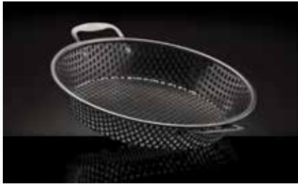
STAINLESS STEEL GRILLING WOK