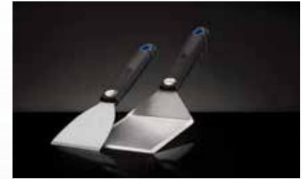
2 PIECE PLANCHA TOOLSET