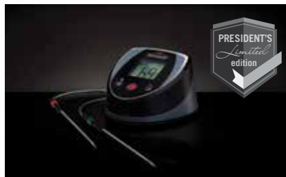
ACCU-PROBE™ BLUETOOTH™ THERMOMETER