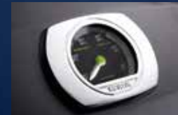
ACCU-PROBE™ Temperature Gauge