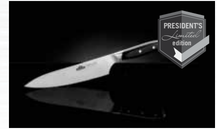
EXECUTIVE CHEF KNIFE