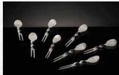
APPETIZER SERVING SET AND CORN FORKS